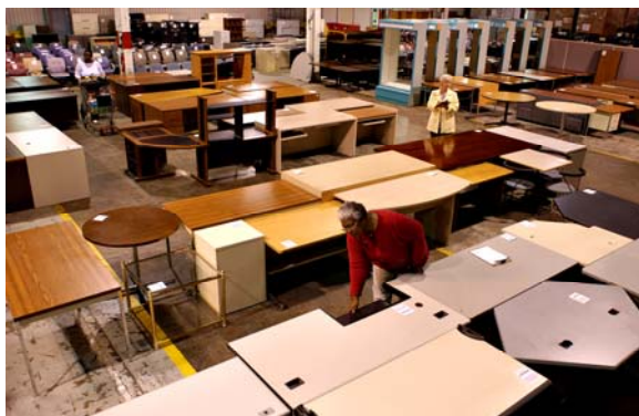
Additional furniture at ReSource