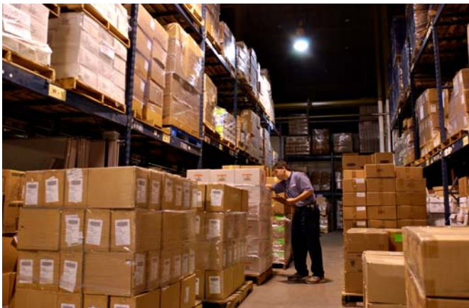
The warehouse at ReSource